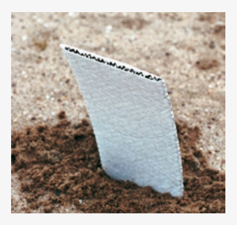
Original CX1000 with separate fleece and core

The resulting material will meet all required design criteria during both installation and service life even in the most exacting conditions and provides distinct advantages through its increased robustness and reduction in soft soil intrusion into the core. Care does need to be taken when looking at specifications from non-integrated PVDs however there