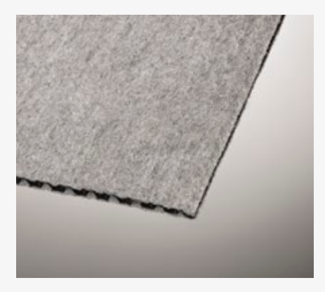
Current CX1000 with integrated fleece and core